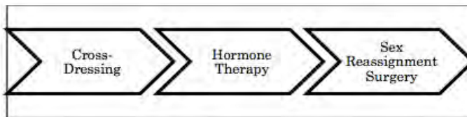
Figure 1: Transgender Spectrum

Transgender is a broad category that includes people who merely “derive pleasure from dressing in the garb of the opposite sex,” 28 to those who have completed the transition process with sex reassignment surgery. Figure 1 provides a simple illustration of the range of behaviors and actions among transgender people. This article will discuss how the law may need to account for differences among people who occupy different positions of the transgender spectrum, and will also show how California AB 1266 broadens this spectrum without accounting for differences among transgender people.