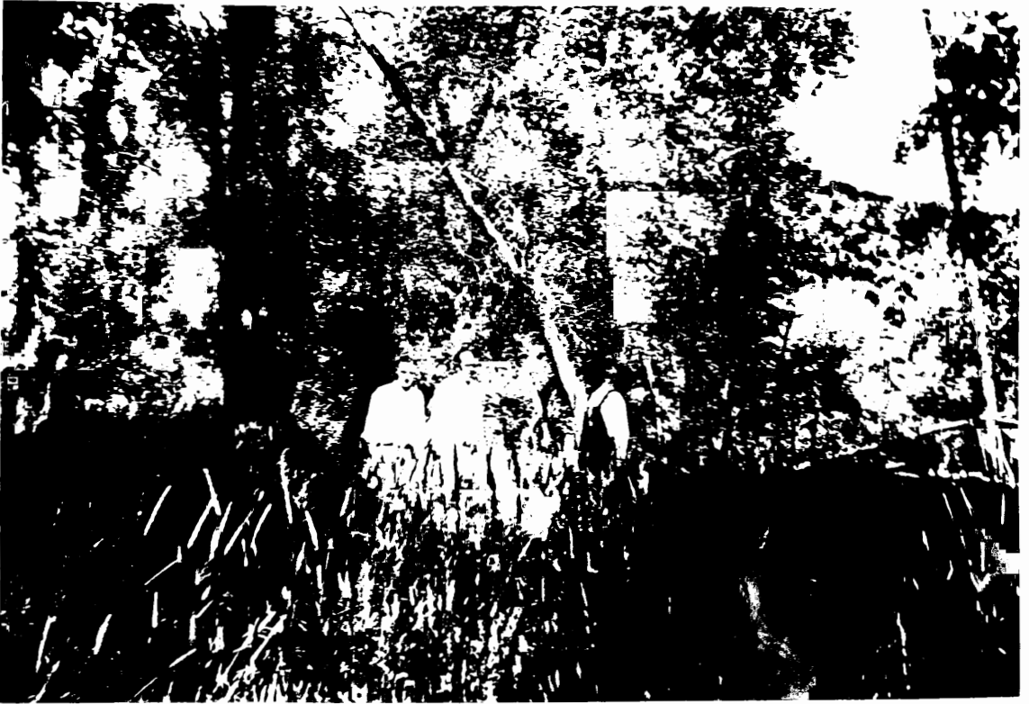
Def. Exhibit #16 showing quality of tree pasture land near river taken by condemnation.