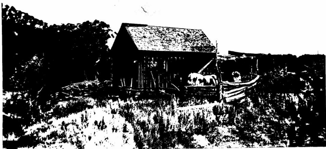
Def. Exhibit #8 showing granery taken by condemnation.