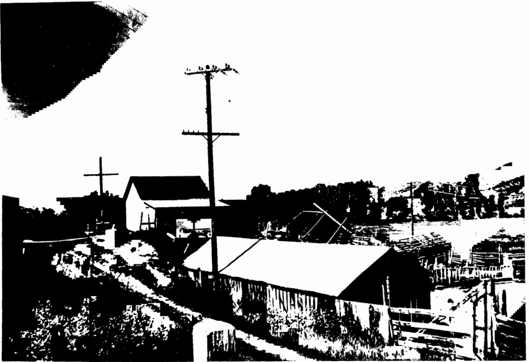
Def. Exhibit #4 showing garage, shop, lounging shed, chicken coop and pig pen taken by condemnation.