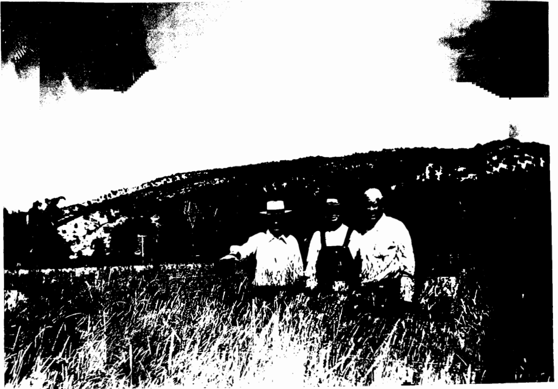
Def. Exhibit #15 showing quality of meadow lands taken by condemnation.