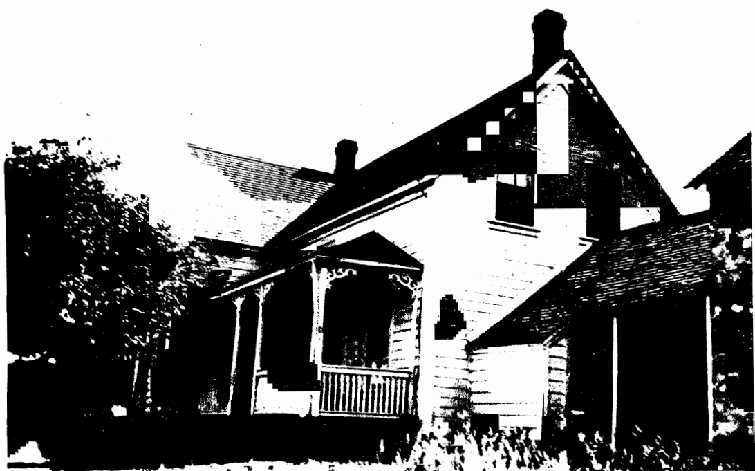
Def. Exhibit #3 showing ranch home taken by condemnation.