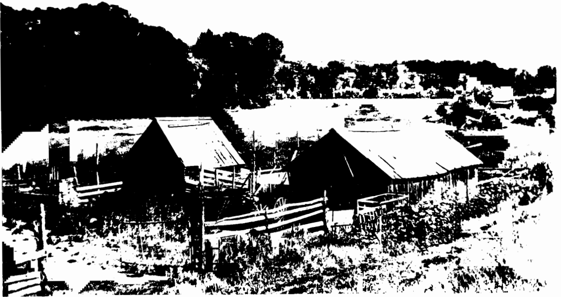
Def. Exhibit #7 showing machine and tool sheds taken by condemnation.