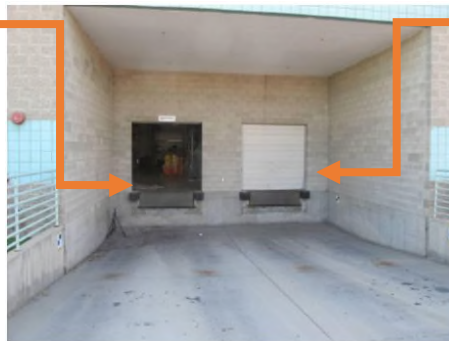
Docking Bay A