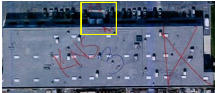
Docking Bay B

and distribute its products. R 1071:13–15. Mike Kelly, the current President of KNS, identified this warehouse as Building 3, shown below. R 1070:13–14. The KNS warehouse has a docking bay designed to receive trucks, and in particular, receive the trailers of tractor trailers. R 1072:7–1073:23; 1821:24–1822:13. Docking Bays A and B in Building 3 are shown below, R 1037–38: