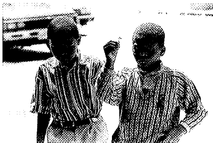
AFTER SUNDAY MEETINGS, YOUNG MEMBERS OF THE BRANCH SEARCH FOR FOUR-LEAF CLOVERS BY THE CHURCH

had never seen before to say a closing prayer. Nevertheless, she encouraged him with a smile, and he replied, "No, I haven't prayed for years and years, and I could not do it." She answered, "Sure you can. Go ahead, and I will hold your hand." She came over and took his hand and then said, "And if you don't do a good job, that's fine. We will ask somebody else to say a prayer after you if your prayer isn't adequate." Given that reassurance, he bowed his head and gave a wonderful prayer. When he had finished, she put her arm around him