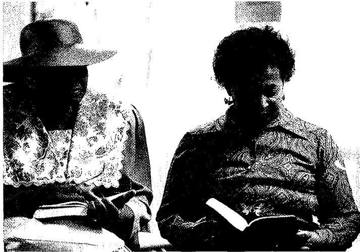
MEMBERS OF THE BRANCH PARTICIPATE IN A TUESDAY NIGHT BOOK OF MORMON STUDY GROUP

The other counselor in the branch presidency is a younger man about three or four years out of college. He grew up in Africa. One of his grandfathers was a minister, and the other was a radical leader. He was offered admission to several American universities, including the University of Idaho, which he attended. While in college, he met Mormon missionaries, but he did not "connect" with them at that time. Subsequently, he decided to go to law school and attended Howard; but he was expelled from the law school for being "too radical." As he explains, "It is quite an accomplishment to be too radical at Howard Law School." In his bitterness, he decided to file a pro se law suit against Howard. He was on a bus on his way to the courthouse when he noticed two Mormon missionaries who soon started talking to him. When he reached his destination, the mis-