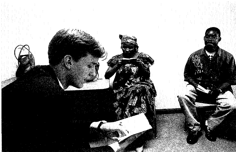
A FRENCH-SPEAKING ELDER FROM TORONTO TRANSLATES FROM THE BOOK OF MORMON FOR WEST AFRICAN INVESTIGATORS

this and place it in the hands of the Lord." He said they prayed fervently and prayed for help with this decision. He continued, "Within three days of our prayers, I received a job. Subsequently I was promoted on that job, and we were able to complete the