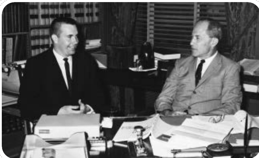
Law clerk Rex Lee enjoys a lighter moment with his boss, Supreme Court Justice Byron R. White, during the 1963 term of the Supreme Court.

says: 'I was an hungred, and ye gave me meat: I was thirsty, and ye gave me drink. . . . Inasmuch as ye have done it unto one of the least of these my brethren, ye have done it unto me?' I said, 'I'm generally familiar with that scripture,' and he said, 'Do you believe it?' I said, 'Yes.' He leaned into me and said, 'Do you live it?' I said, 'I try to.' He stomped away and with dramatic flourish said, 'I think not!' And he sat down. That was the whole thing! We had an intermission shortly after that, and I asked the prosecutor what he thought, and he said, 'Thank you. You did fine. We'll let you know how it turns out.' I then pointed to the defense lawyer, who was huddling up with the landlord, and I said, 'So, what was that all about?' and he said in Swedish, 'Jag har ingen aning,' which means, 'I have no idea.'