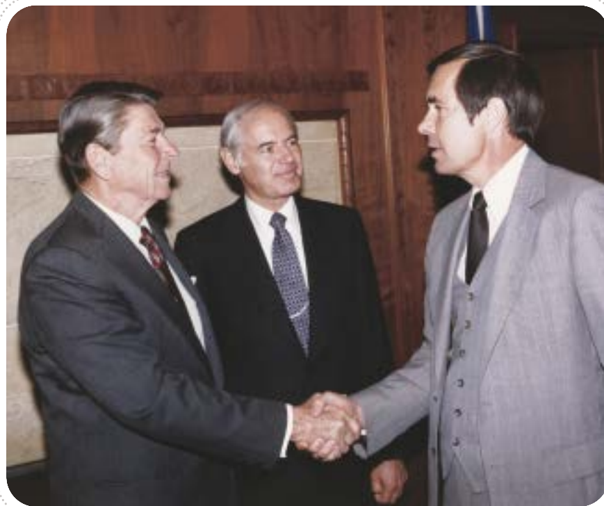
President Ronald Reagan and attorney general William French Smith meet solicitor general Rex E. Lee during Reagan's first term in office.