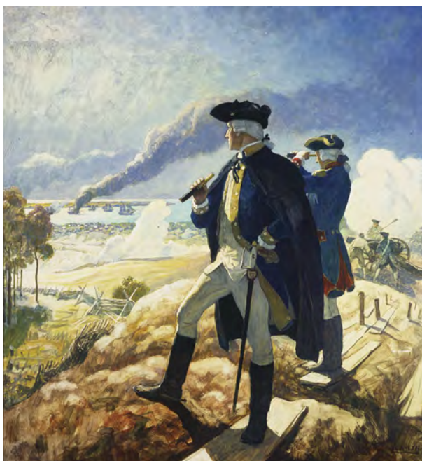
In 1781 General George Washington—“whose heroic honoring of rights and fulfillment of duties never fail to inspire and should never be forgotten”—courageously led his troops into the Battle of Yorktown. The 20-day siege ended the Revolutionary War, with help from French allies, and led to America’s independence.

As Latter-day Saint lawyers, we intuitively sense all of this. We know, for example, that with professional privilege and power come professional responsibilities. And our scriptures tell us that with greater knowledge (which is also a power and a privilege) comes greater accountability 34 and that everyone