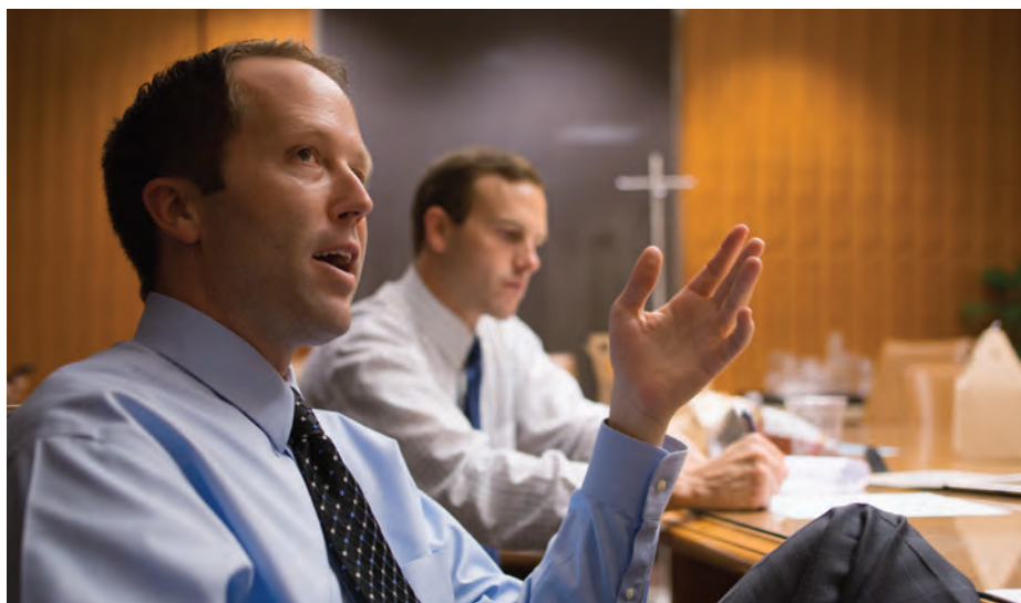
2013-14 PRACTITIONERS COUNCIL

This document was prepared not only to help formalize the council and set forth its objectives but also to serve as a reference sheet for the attorneys who would become members of the council. For this purpose we also included a few examples of what council members would be asked to do. We did not want the document to be overwhelming, but at the same time we wanted to clearly lay out what we hoped the council would be.