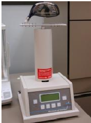
Diagram 3: Moment of Inertia Test Machine

impact). Regulators suggest that technology which limits the clubhead and shaft twisting will reduce the skill component of the game. 40 The rules now provide that the “moment of inertia component around the vertical axis through the clubhead’s center of gravity must not exceed 5900 g cm 2 (32.230 oz in 2 ), plus a test tolerance of 100 g cm 2 (0.547 oz in 2 ).” 41 As noted by the R&A, the purpose is to provide for protection “against unknown future developments . . . whilst allowing some technological evolution.” 42 The evolution of technology may be cut short by the mechanisms of antitrust regulation.